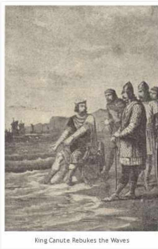
King Canute Rebukes the Waves