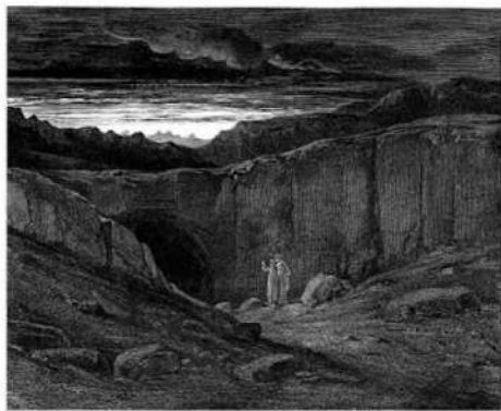
Gustav Dore depicting Dante outside the gates of Hell